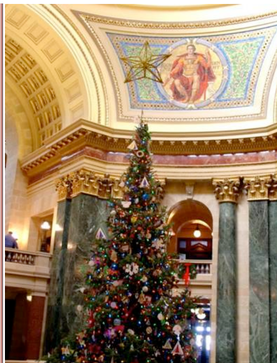
Juletræ i Capitol bygningen i Madison